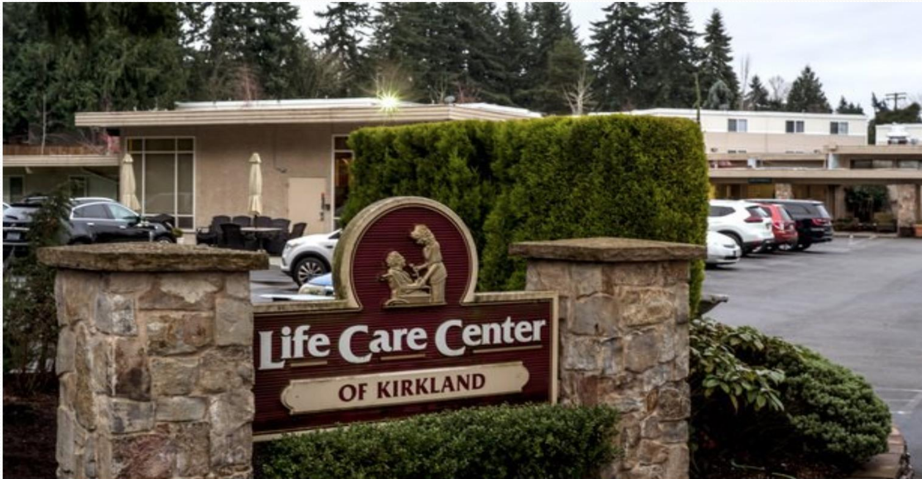
Street view of the Life Care Center of Kirkland building, ground zero of the coronavirus outbreak in Kirkland.